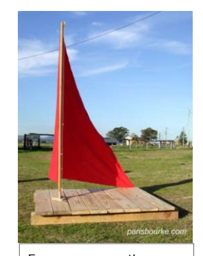
Encourage creative, imaginative play through flexible, adaptable and interactive elements.