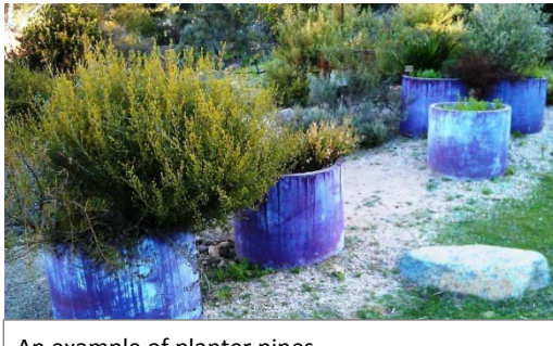
An example of planter pipes

A small stepping stone path meanders through proposed new shrub plantings in the Northern corner of the courtyard. Planter pipes filled with hardy and sensory shrubs are included in three locations. In the Southern corner a balance log circuit, Teepee cubby and pretend campfire are located near new shrub plantings and amongst