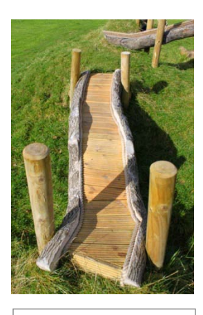
Using natural materials to create imaginative opportunities

A set of 2 or 4 swings is proposed to the North of the staff carpark. Swings were popular in the consultation findings and this site would be very suitable. Final size of the softfall will depend on the swings selected but clear space near the stormwater pit needs to be maintained, along with vehicle access through the gate near the carpark.