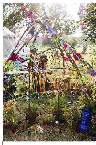
Recycled, colourful, safe materials

The Activity Fence is accessible from both sides to allow children both inside and outside the Preschool fence to use it. Deciduous tree planting will shade the fence in due course.